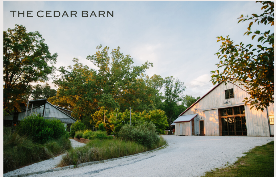
THE CEDAR BARN

Take one more thing off your list and enjoy our pre-packaged Summit and Haven offerings designed to create lasting moments.